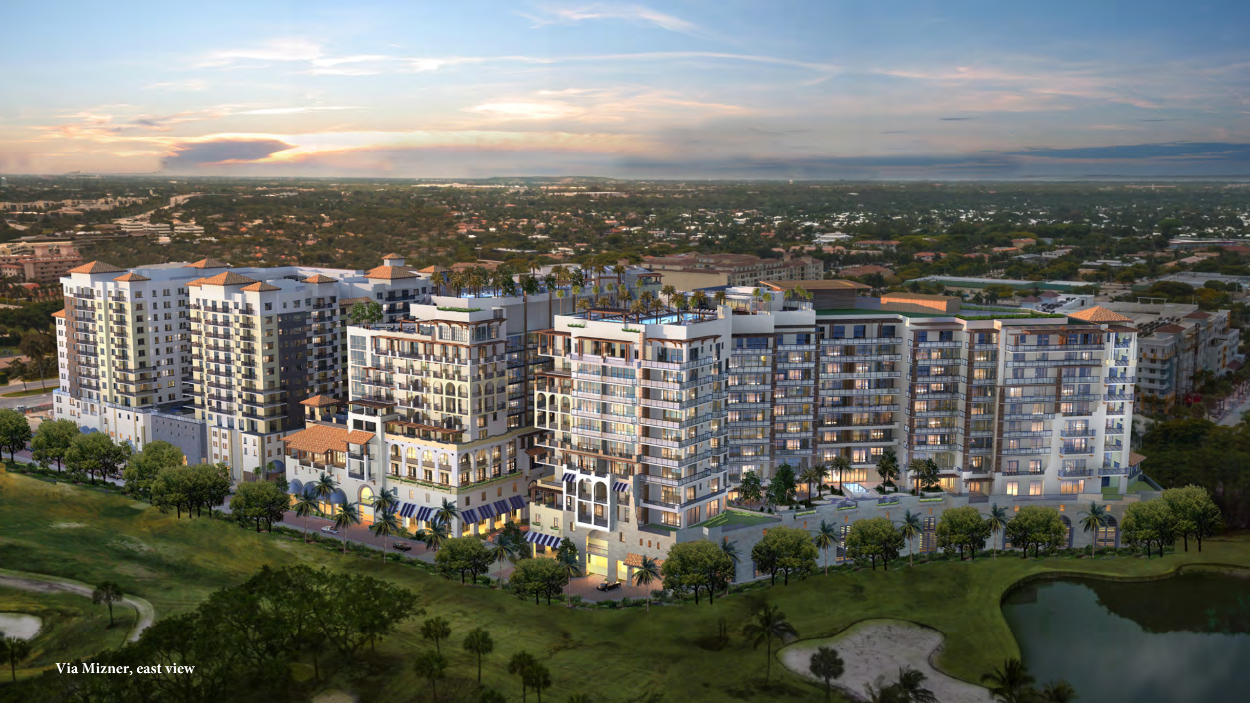
Via Mizner, east view