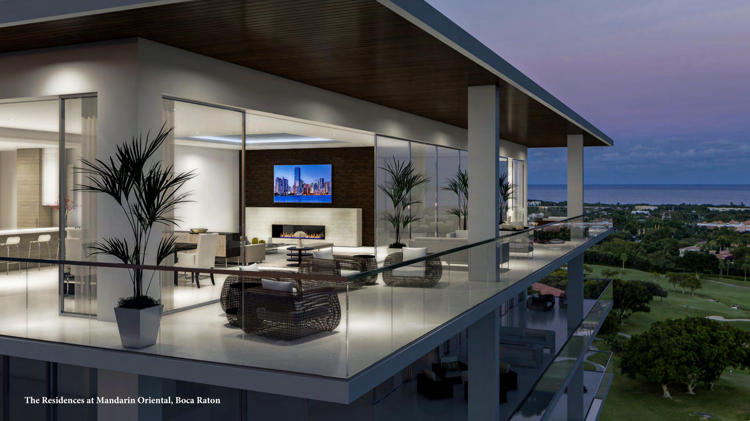
The Residences at Mandarin Oriental, Boca Raton