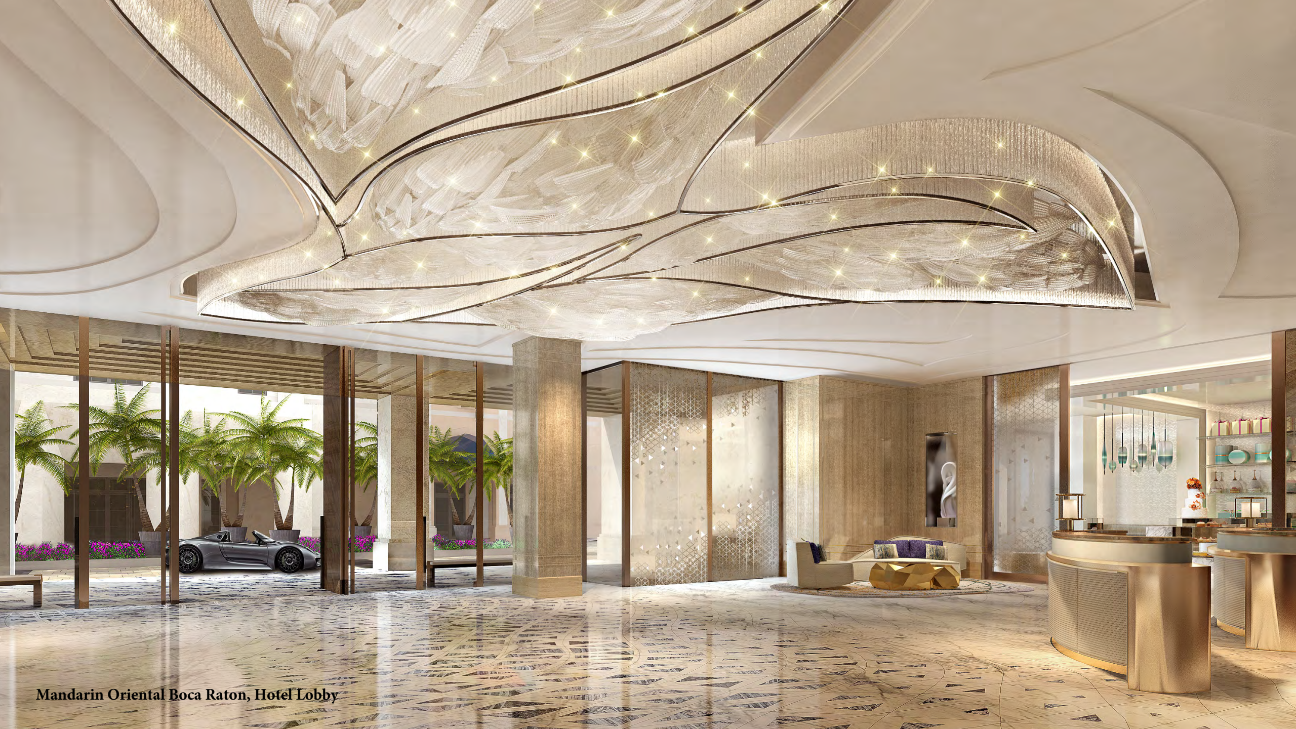
Mandarin Oriental Boca Raton, Hotel Lobby