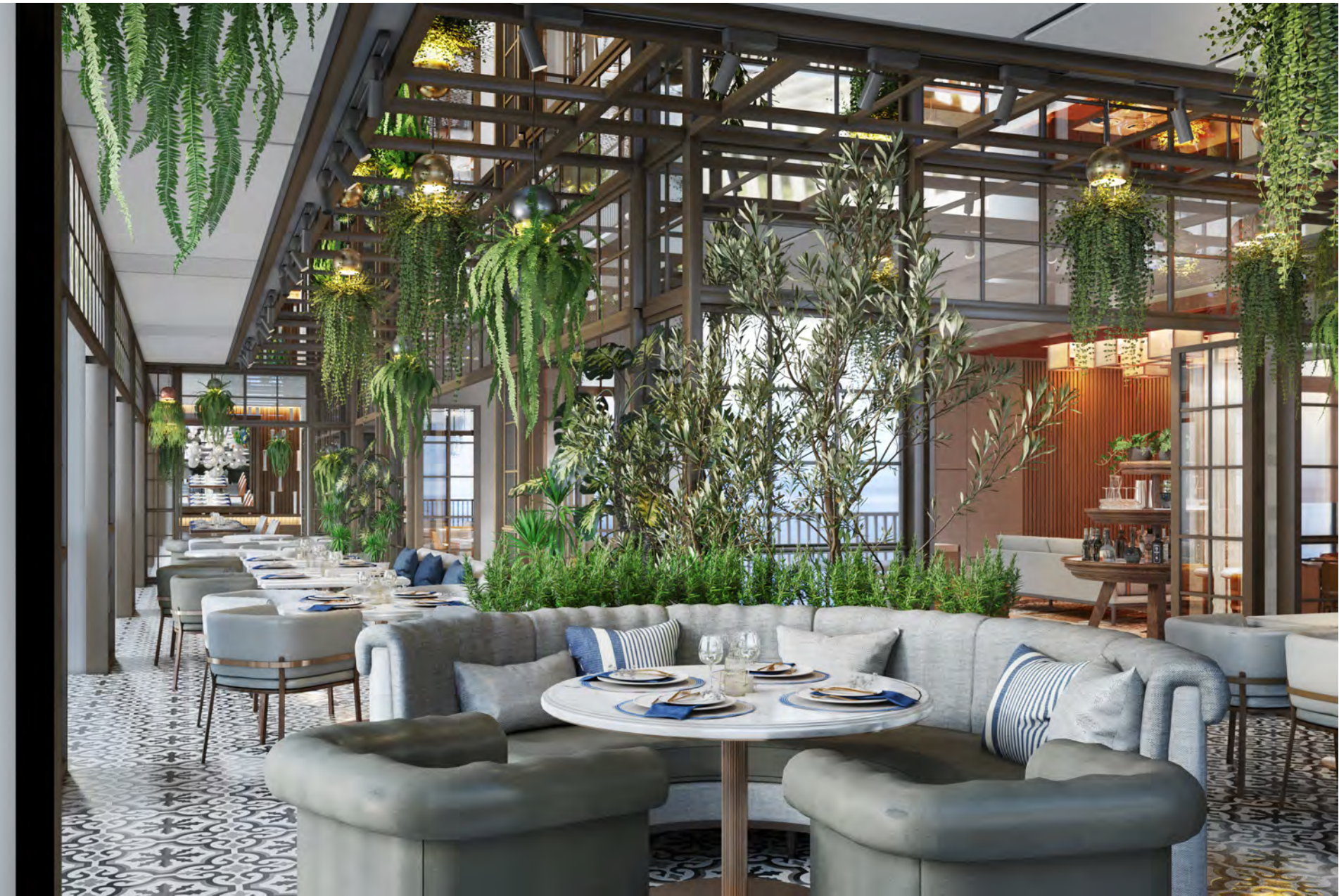
Mandarin Oriental Boca Raton, City Club Restaurant